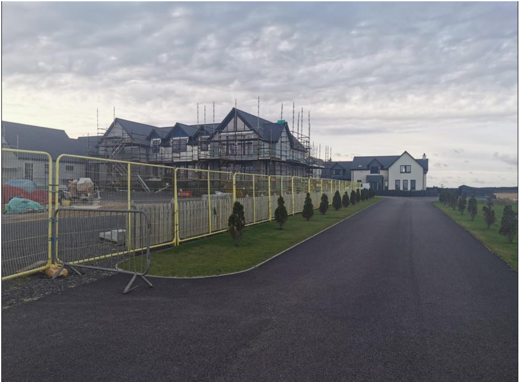
Site from access road