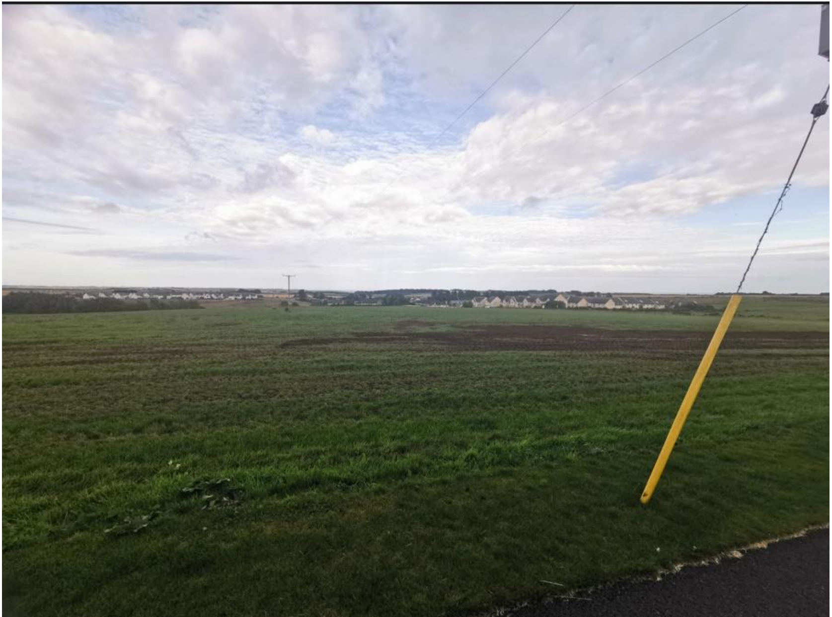
Foveran from site looking across the allocated site