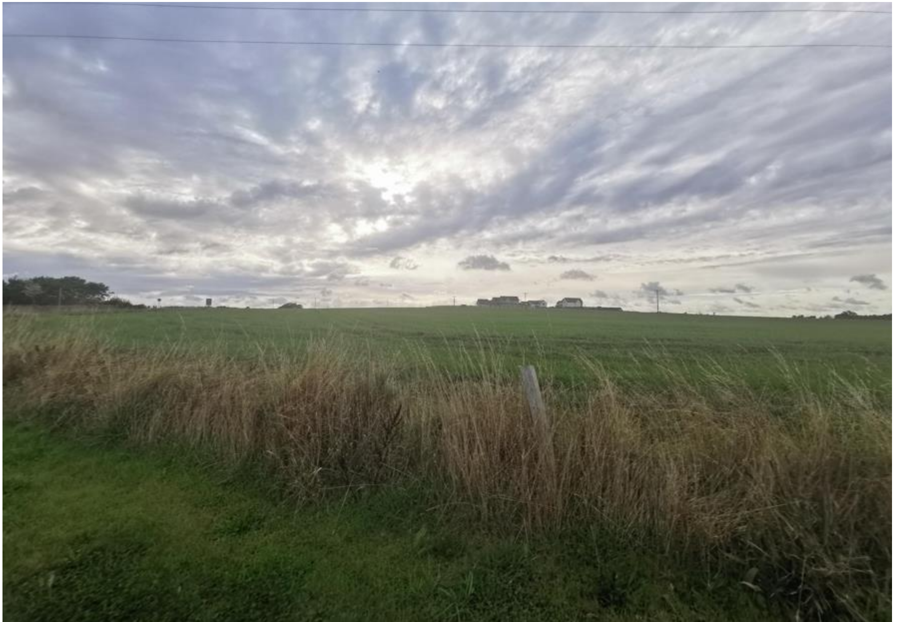
Looking across allocated site to development