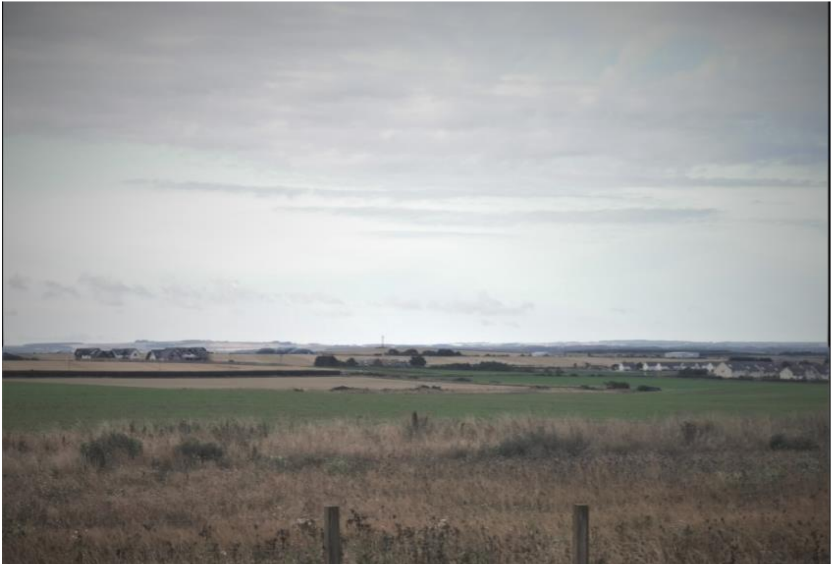
Site on the left and Foveran on the right from the south