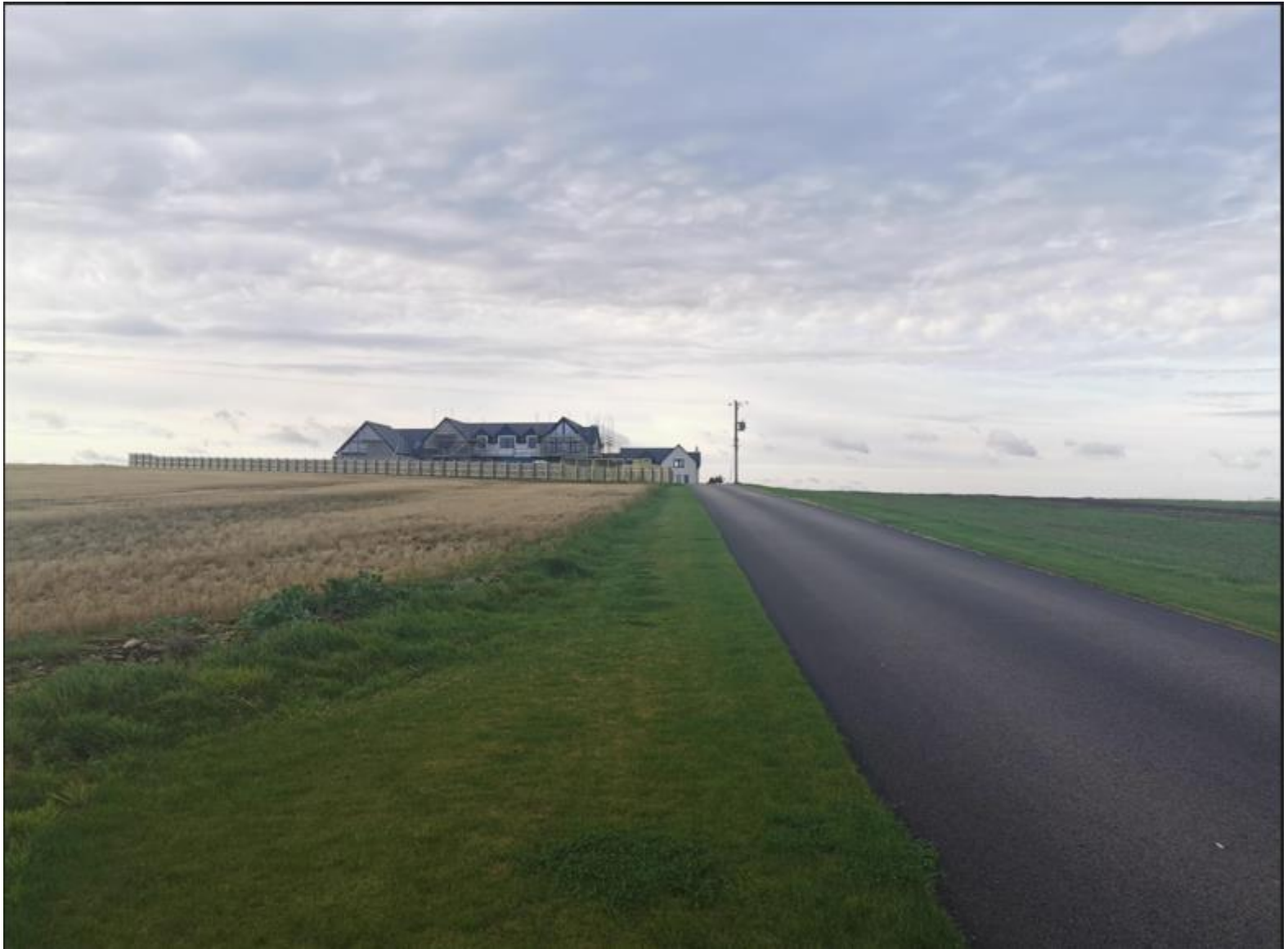
Site from access road