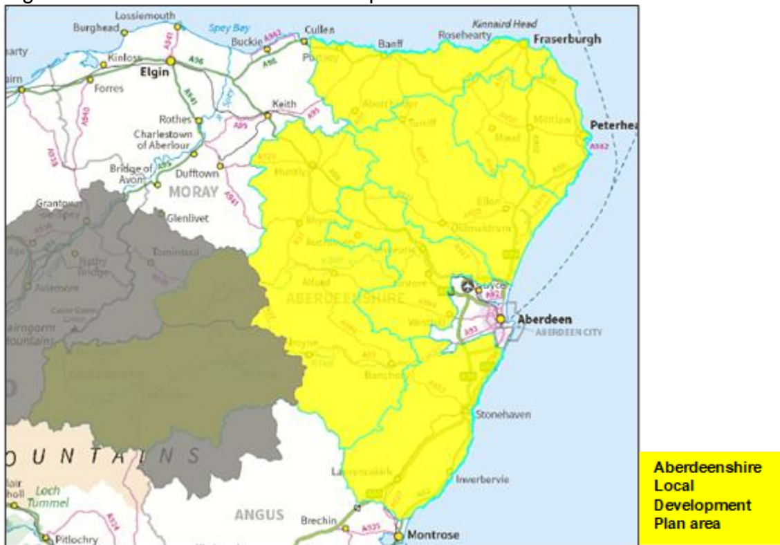
Figure 1 Aberdeenshire Local Development Plan Area

These two documents provide the context for deciding planning applications at the current time. It can be anticipated that a new Aberdeenshire Local Development Plan 2021 will be adopted within approximately 12 months to provide an up-to-date framework.