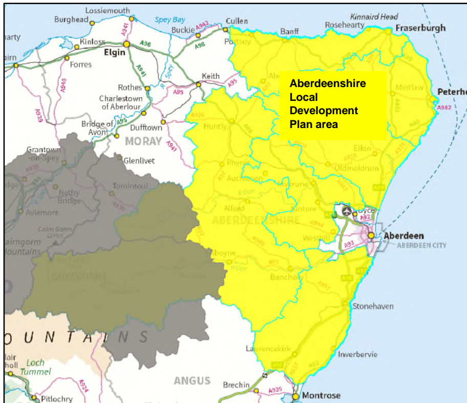
Figure 1 Aberdeenshire Local Development Plan Area

Engagement and participation on the production of the Plan is of great importance, as it is an accessible and public element of the Council's business and has a great influence on the places where people live and work. The Plan draws on other public strategies of Aberdeenshire Council and reflects the transport, housing, and economic development strategies that we currently use, all influenced by the Aberdeen City and Shire Strategic Development Plan, National Planning Framework, and Scottish Planning Policy, amongst others. It sets out a land use vision for the area to complement these other strategies.